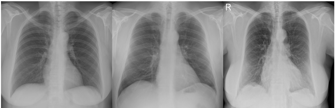
Figure 1 – Examples of low-risk chest X-rays used in the study.

Data for this study were obtained from a specialized center, OTRAN Kutná Hora, which provides comprehensive care for patients with chronic lung diseases, including preventive